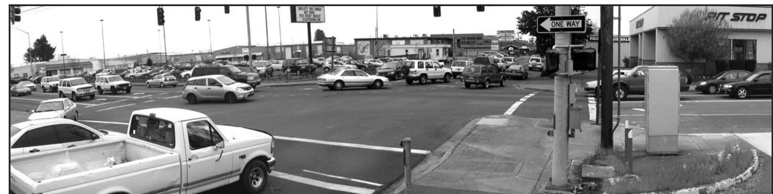
West 11th Avenue and Garfield Street

Alternative formats of printed material and/or a sign language interpreter will be made available with 48 hours' notice. The facilities used for these meetings are wheelchair accessible. For more information, call 682-6100 (voice) or 1-800-735-2900 (TTY - Oregon Relay). Si desea información en español, por favor llame a LTD al 682-6100 ó visite nuestra pagina web: www.ltd.org