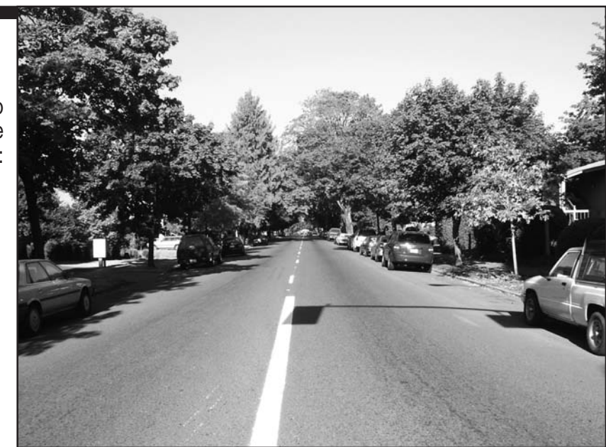
Residential area on West 11th Avenue