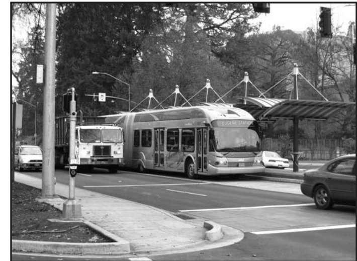
EmX on East 11th Avenue at the University of Oregon Dads' Gates

West 11th Avenue is the main corridor for travel to western Lane County and the Oregon Coast. Along this corridor are several major employment centers, large commercial developments, a growing residential population, and valuable natural resources. Growth in traffic along the corridor creates congestion and safety issues for businesses and residents that make it tough for all travel, including by bus. Without improvements, these issues will only get worse. Continued growth in the area is spurring development that emphasizes mixed-use communities where daily services are within walking distance and can be easily accessed by bicycle and transit.